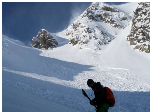
Figure 2: Bargues peak slab. Crown and upper part of avalanche triggered.

Few days after, near the crown, the avalanche center team made a field observation describing a very unstable snowpack structure with an active persistent weak layer. The avalanche danger was rated 3-Considerable with Drifted snow and a Persistent weak layer, especially on north and east aspects and in the Alpine. The mind-set transmitted from the avalanche center was to Step Back.